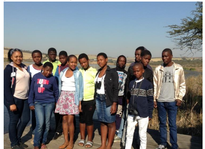
The youngsters on their day out at Tala Game Reserve.