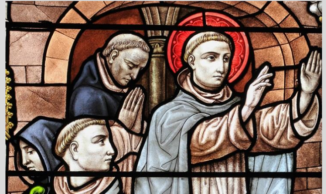
Stained glass | St. Dominic sends out the Friars

Born in old Castile, Spain, Dominic was trained for the priesthood by a priest-uncle, studied the arts and theology, and became a canon of the cathedral at Osma, where there was an attempt to revive the apostolic common life described in the Acts of the Apostles.