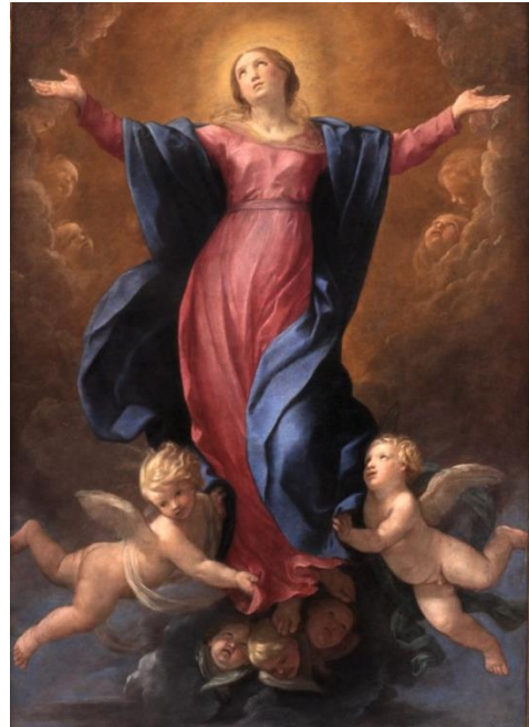
Assumption of the Virgin, 1580 – Guido Reni