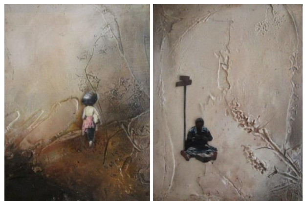
Two beautiful pieces from Lara's postcard collection.