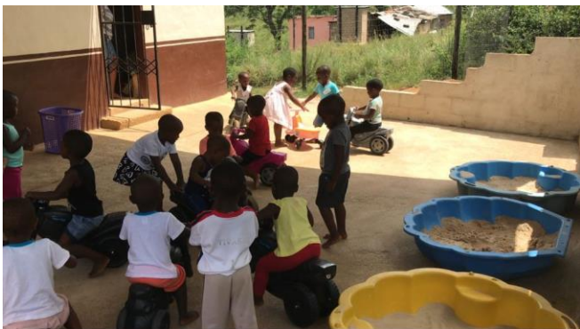
The pre-schoolers at Bethlehem enjoying their new pushbikes.