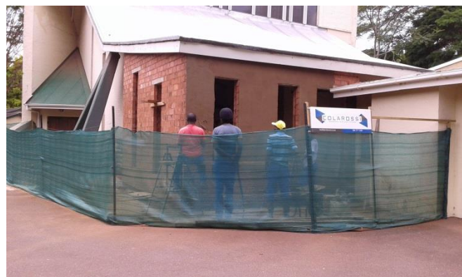
A recent photo of the extension for the choir area.